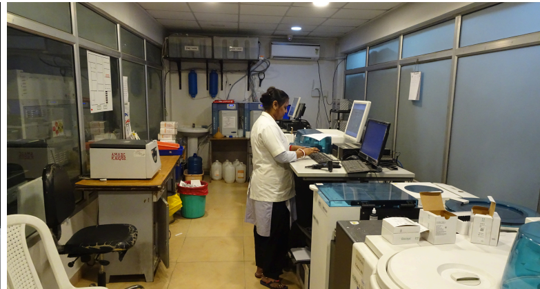
AMA BLOOD CENTER