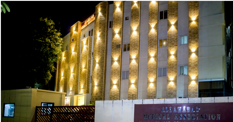
AMA CONVENTION CENTER