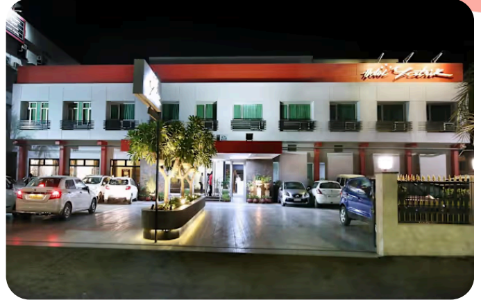
HOTEL YATRIK 33, Sardar Patel Marg, Civil Lines 211001, India