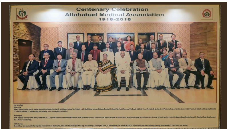
AMA CENTENARY CELEBRATION