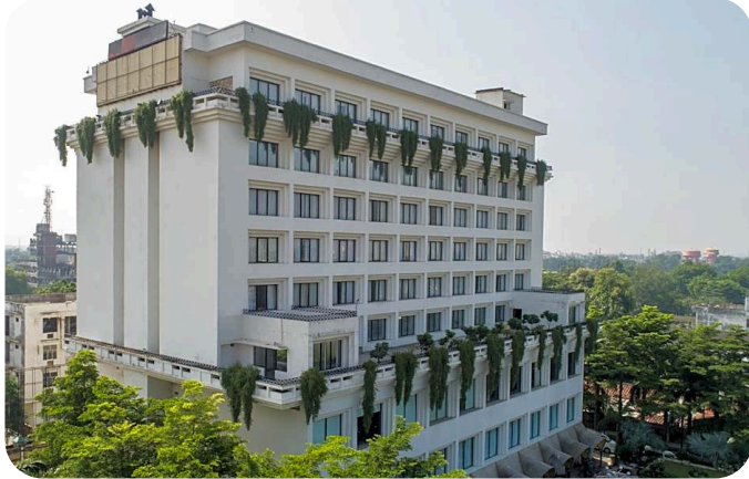
HOTEL KANHA SHYAM Civil Lines, Allahabad, 211001, India