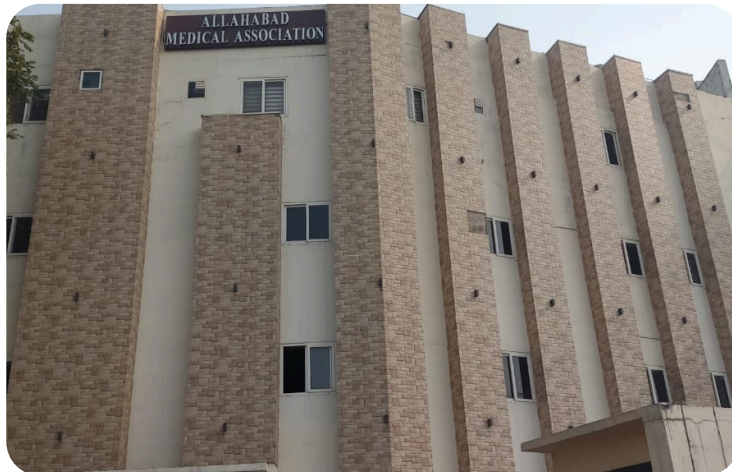
AMA CONVENTION CENTRE 1/1A/1 Stanley Raod, Prayagraj